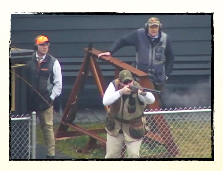
SHARK's drone filmed vile members of the Philadelphia Gun Club killing innocent pigeons for fun

This is Penny. We found her when we were working on anti-cockfighting issues in Kentucky. As we were driving down a rural highway, we saw her, and we immediately pulled over to rescue her. She was terrified, scrawny, and covered in ticks.