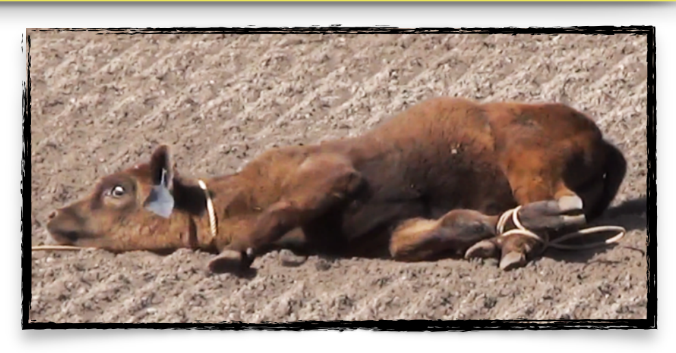
Calves, just a few months old, suffer terrible abuse at rodeos

No one has gone after rodeos as SHARK has for decades. From baby calves, steers and horses suffering horrific abuse, injuries and death, SHARK has documented rodeos from one end of our country to the other and into Canada. Our videos have exposed numerous stock contractors electro-shocking horses to force them to perform. This vast trove of evidence completely destroys the myth that horses are, "born to buck." They are, in fact, "brutalized to buck."