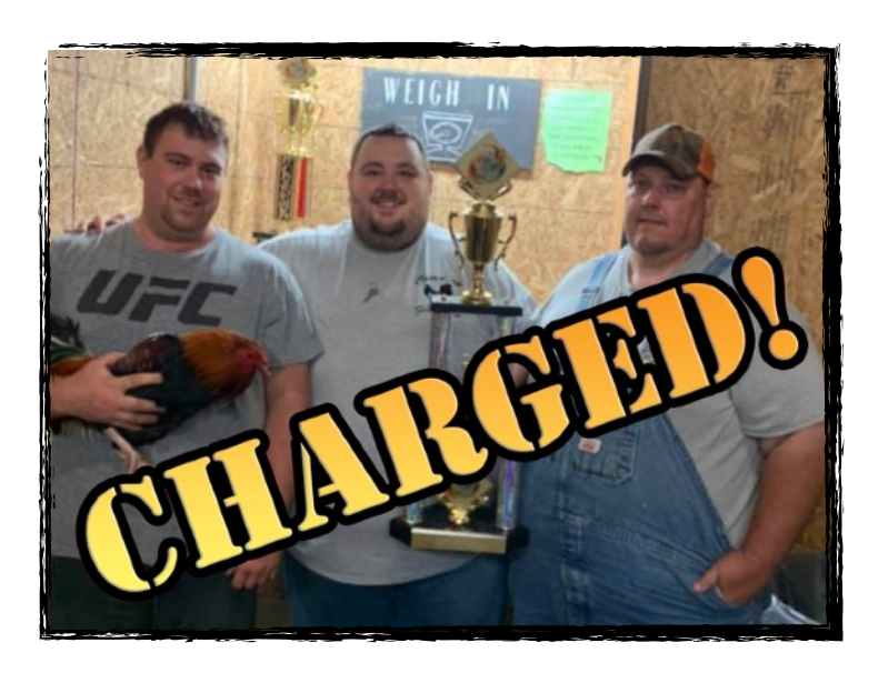
We received a tip that a father and son cockfighting team in Kentucky (middle and right) were also law enforcement officers. We investigated them, collected evidence and we are proud to announce that both men have been charged and are awaiting trial for their crimes!

When we saw that many of these cockfighters were openly posting about their criminal behavior on Facebook, just as the father and son to the right had, we began a major effort to collect evidence on dozens of cockfighters, spanning 22 states. We are not able to talk about all these investigations, but we can tell you that, after we sent a detailed report to the Texas State Police about a large cockfighting operation called the Salinas Game Farm, we were told that arrests have been made and further investigations are ongoing! Having individual cockfighters charged for breaking the law represented extraordinary victories in our battle against cockfighting, but it was just the beginning.