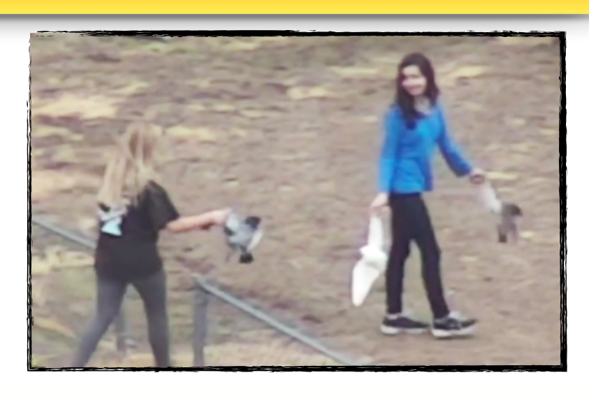
SHARK filmed terrible cruelty at Broxton Bridge, including children abusing wounded birds