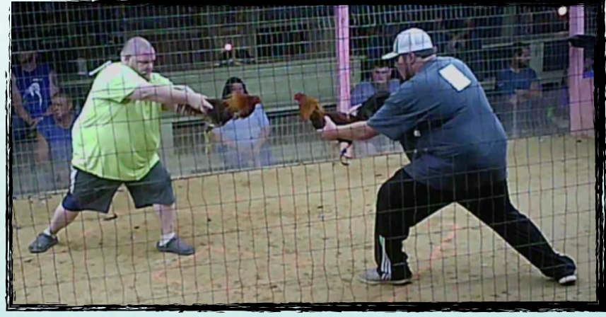
SHARK undercover video from a KY cockfight

This shows just how effective SHARK's work is!