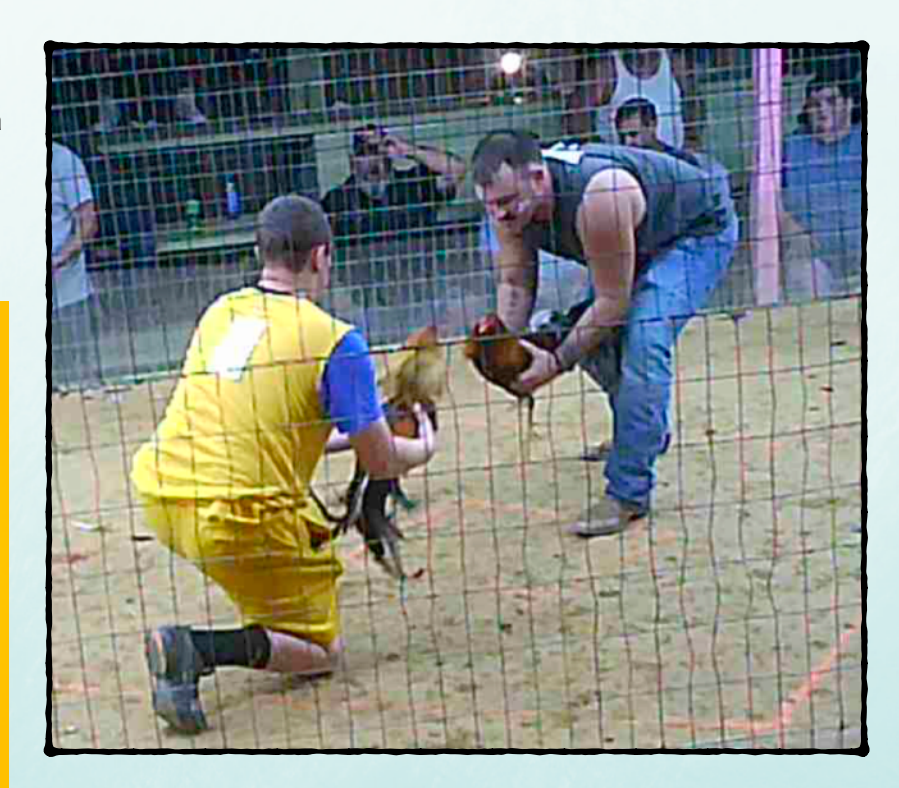
Our investigators risked their safety to infiltrate cockfights and film them

We aren't in this for a quick photo-op and then move on as others have, we are fighting this battle to save lives.