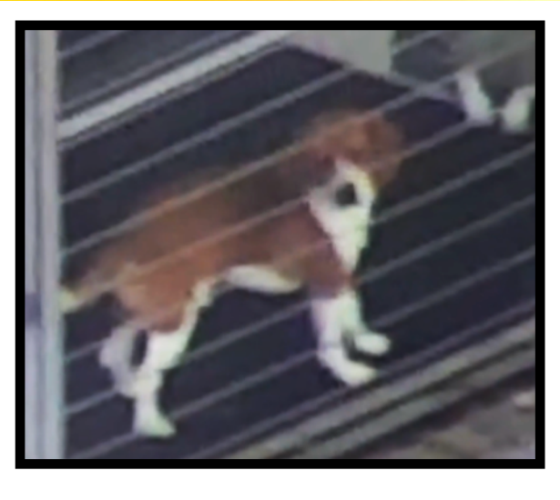
Dogs like this, imprisoned at Envigo, had no hope before SHARK. We will never stop fighting for animals