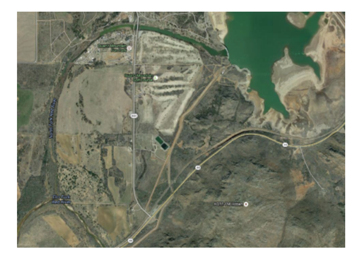
Exhibit 1: Location Kiowa County, OK 34°52'29.9"N 99°18'21.6"W