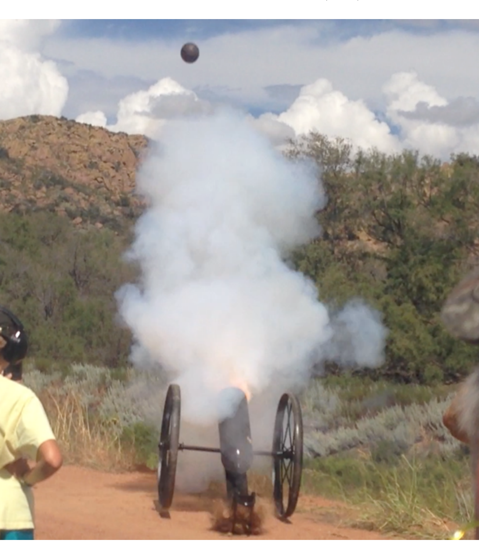
Exhibit 4: Cannon being fired twice (video available upon request)