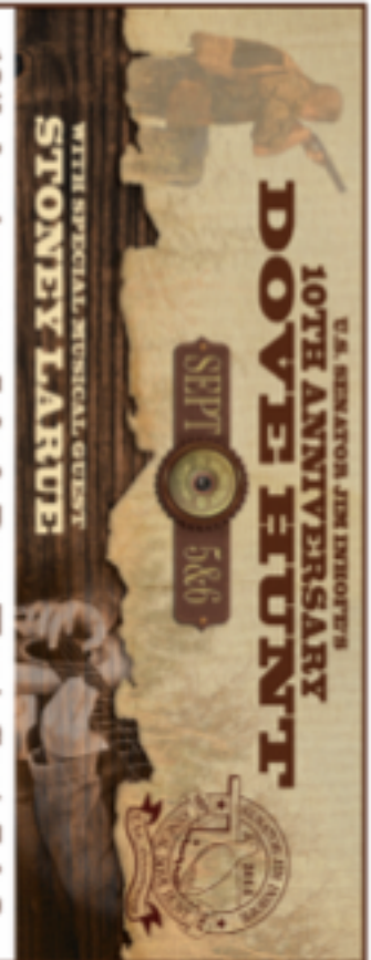
Exhibit A: Senator Inhofe's fundraiser flyer and schedule of events

10th Anniversary Inhofe Dove Hunt • Sept. 5 & 6 Gold Level Host $1,250 per person ($2,500 per PAC)* Special reception as Gold Level Sponsor. Friday host reception and dinner. Host location for Saturday morning hunt and lunch. Includes commemorative 10th Anniversary Dove Hunt Pocket Knife. Silver Level $500 per person ($1,000 per PAC)* Special reception as Silver Level Sponsor. Friday host reception and dinner. Host location for Saturday morning hunt and lunch. Includes commemorative 10th Anniversary Dove Hunt Pocket Knife. Non-Hunting Reception & Dinner Tickets $250 per person Friday host reception and dinner.