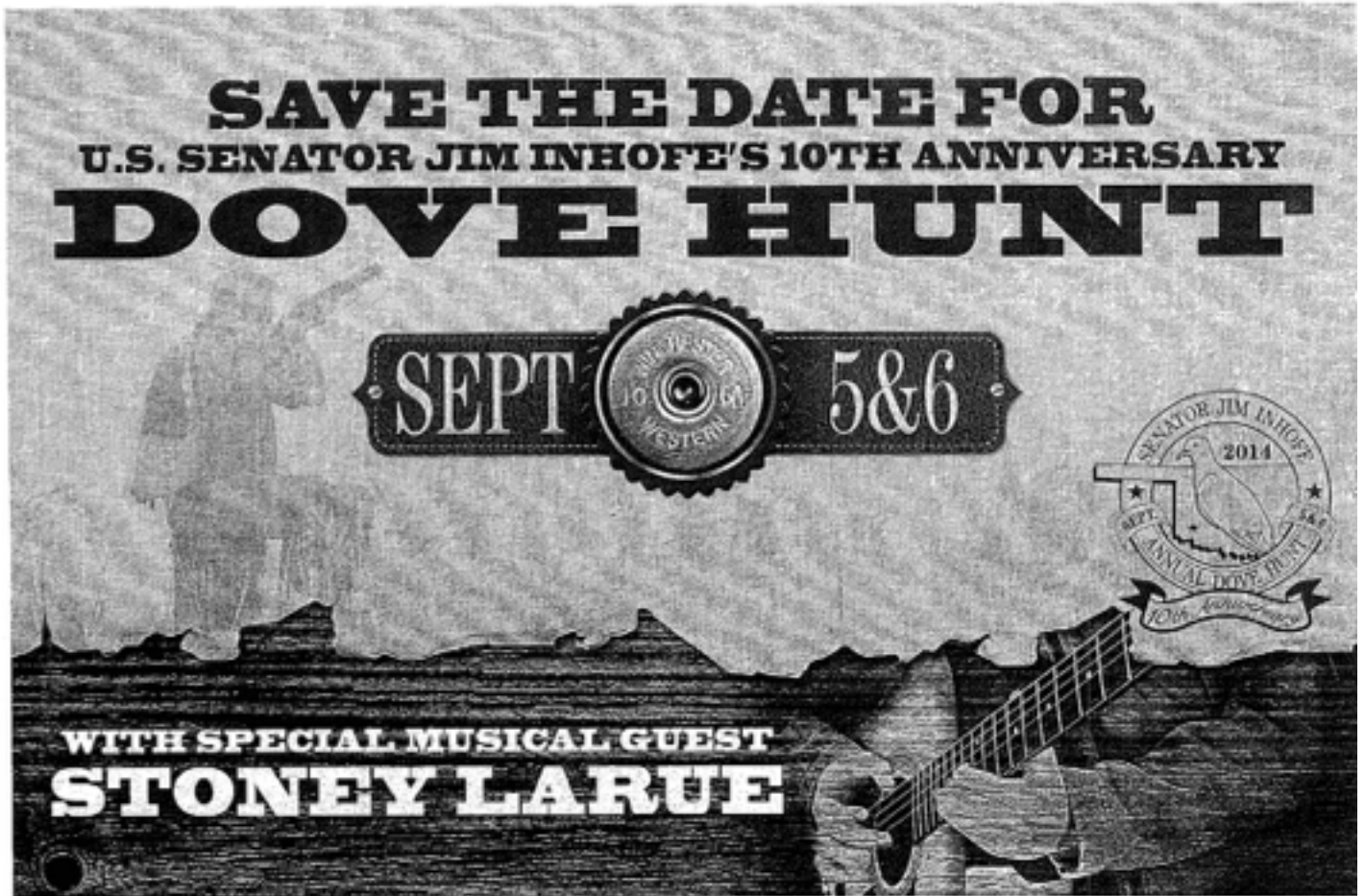
Exhibit D: Inhofe fundraiser invitation sent to OWDC