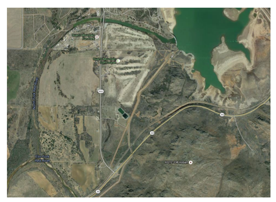
Exhibit 1: Location Kiowa County, OK 34°52'29.9"N 99°18'21.6"W