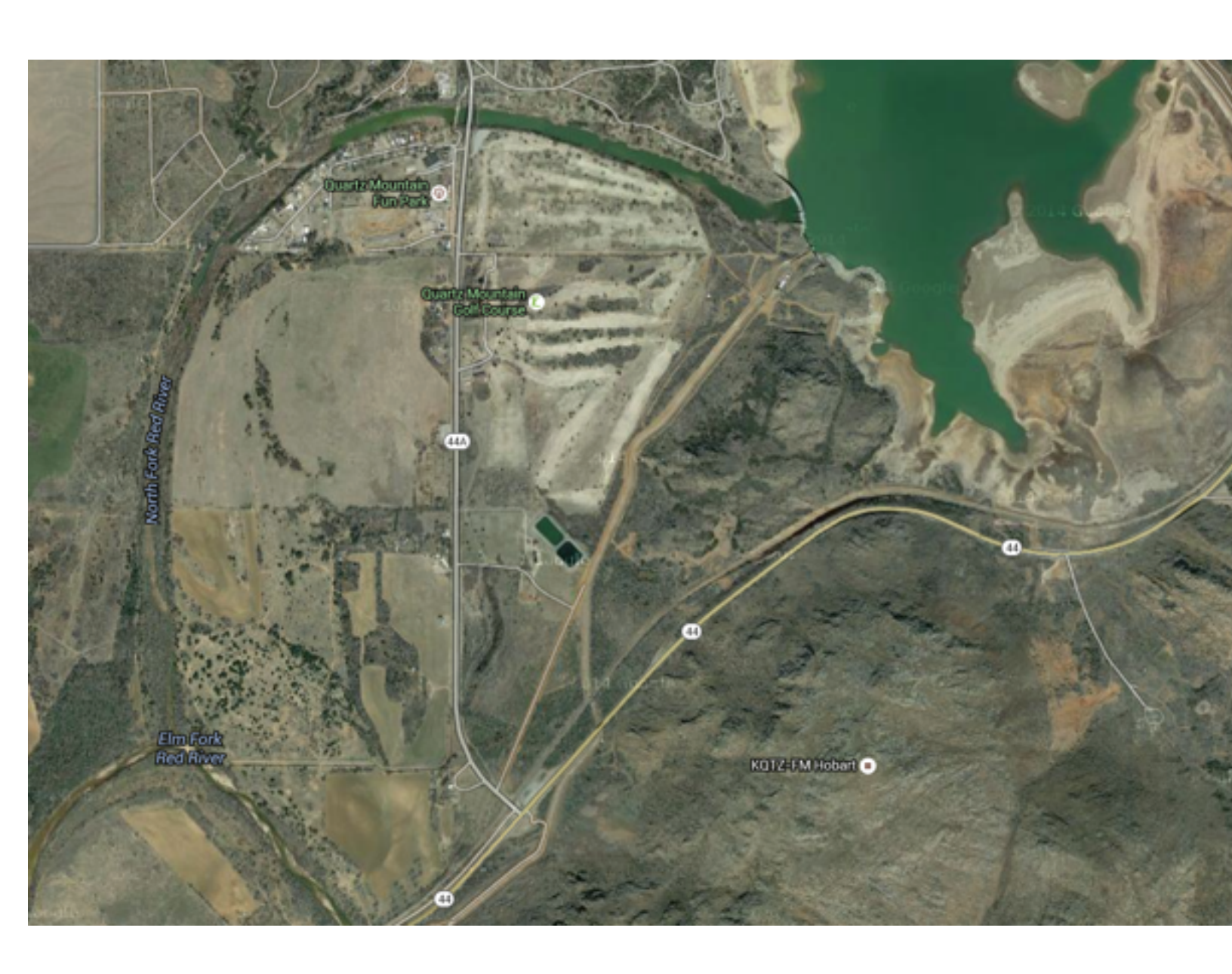
Location Kiowa County, OK 34°52'29.9"N 99°18'21.6"W

• I am including a Google maps picture of the area in question so that you can see the property location.