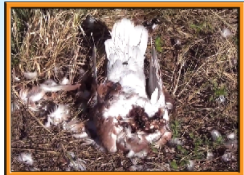
One of the many dead pigeons Inhofe left to rot

SHARK put out a nationwide call for activists to join us in this important fight, and we want to thank those who were there with us.