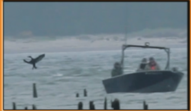
Above left: A beautiful cormorant, just like the thousand who were killed. Above right: The Wildlife Services killers. Never before had someone gotten this close to them. Bottom: Wildlife Services shoots a cormorant who falls into the river