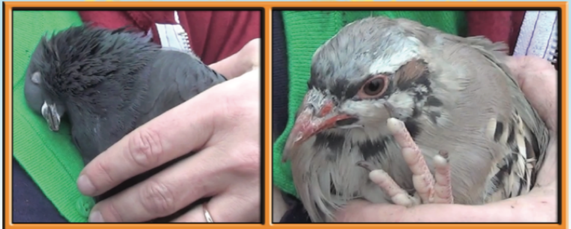
Left: This poor bird died soon after we rescued her. Right: This bird lived and was taken to a sanctuary

In early 2016 SHARK documented a canned hunt held in Pennsylvania, where cage-raised birds were hand-thrown into the air and shot for fun. Three different types of birds were used for this slaughter; pheasants, pigeons and chukars. We had access to an