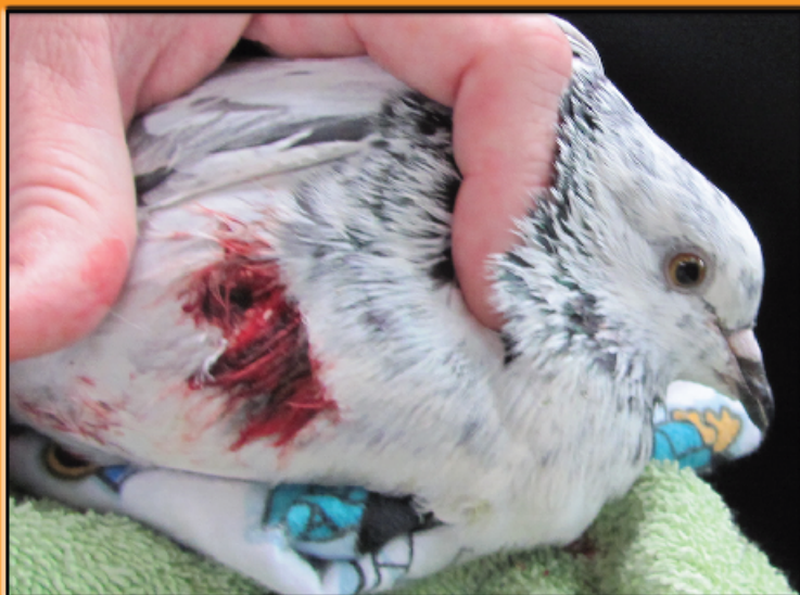
One of the many victims of the Philadelphia Gun Club that we rescued. Pigeon shoots are killing for the sake of killing with pleasure taken from the spilling of innocent blood

The federal lawsuit targeted not only SHARK but five of our investigators by name. We contended that the lawsuit was baseless and the federal judge hearing the case agreed! The judge threw out the lawsuit before it went to trial, stating that the charges that we violated federal law were "sheer conjecture" and unsupported by any evidence. This was a legal victory where David stood against Goliath and won.