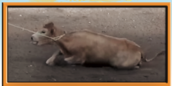
This innocent calf was choked by a rope and injured at the Cheyenne Frontier Days Rodeo

The Cheyenne Frontier Days Rodeo (CFD) is the world's most cruel rodeo, and SHARK was there again this year to document the suffering and deaths that happened for entertainment. When the Wyoming Tribune Eagle did a fluff piece on the CFD, we released a video unmasking their biased reporting. To my surprise, I received a call from the editor of that paper who did not defend what had happened but instead acknowledged that they had indeed made a mistake by publishing such a one-sided story. This was an important turn of events and proves how our work documenting animal cruelty can change minds.