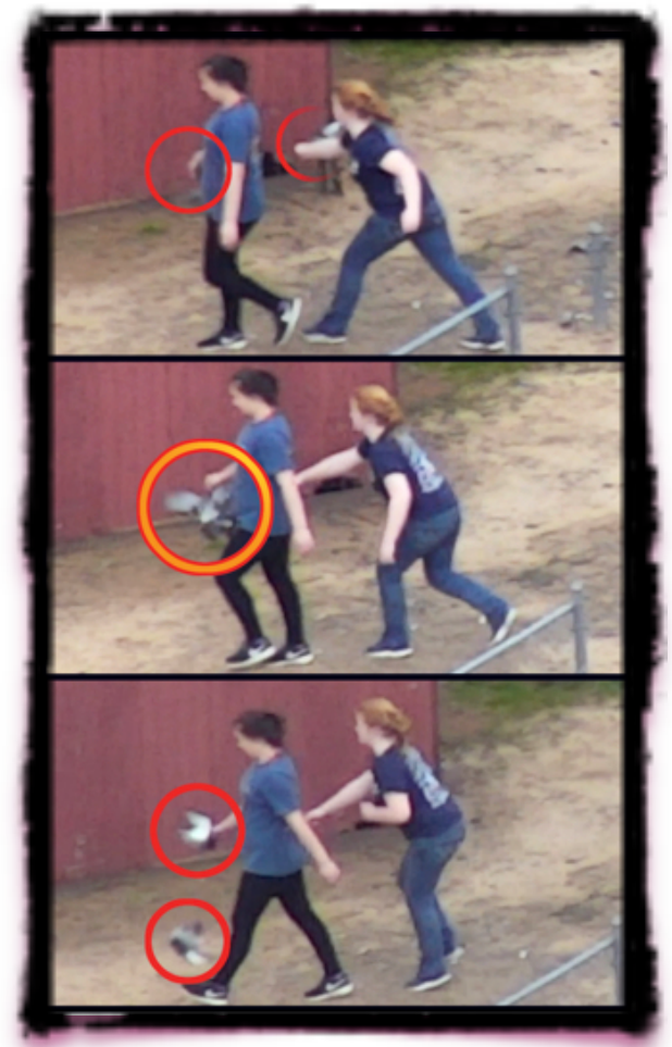
The girl on the right used a wounded pigeon to strike a pigeon held by the other girl at Broxton Bridge

In February we exposed a pigeon shoot at a former slave plantation called Broxton Bridge. Our drones caught children torturing wounded pigeons and dumping them, still alive, into garbage bins. We also captured video and audio of Broxton Bridge personnel conspiring to shoot down our drones in violation of federal law. Even with clear evidence that they did violate state and federal law, the US Attorney for South Carolina refused to prosecute, most likely because the wealthy owner of Broxton Bridge has deep political connections.