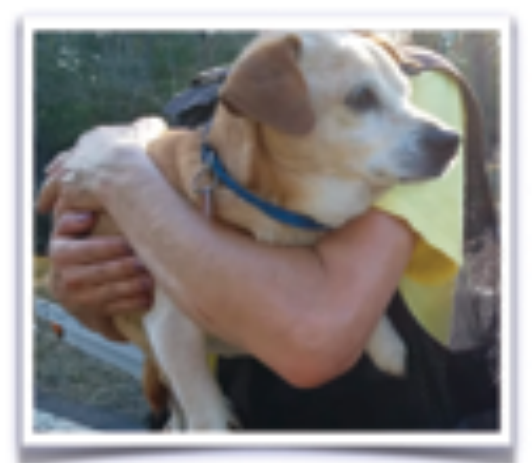
A dag rescued during SHARK's efforts in North Carolina

to speed the transport of rescuers and supplies to abandoned or stranded animals in flood zones. The rescuers we carried were very excited about not having to slowly slog through toxic flood waters on foot. Our hovercraft makes rescues faster and safer so more animals can be saved.