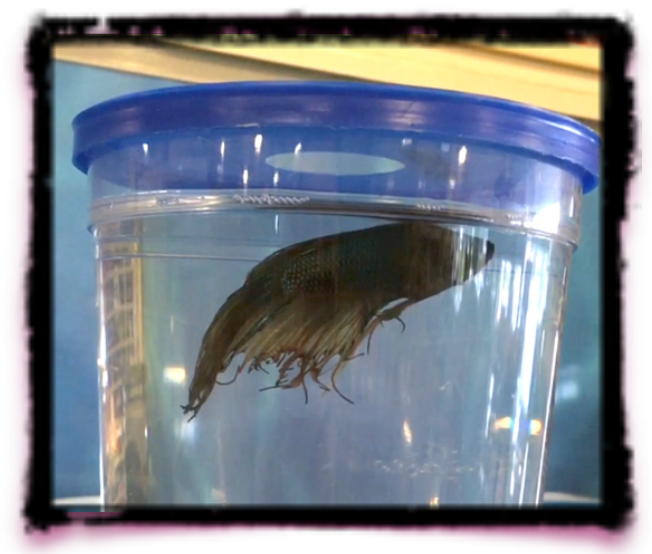
A dead betta, in a sterile jail cell

SHARK is teaming up with Fish Feel to bring attention to the cruel betta fish industry. These animals are held in tiny containers, devoid of any stimulation whatsoever, until they are either sold, or until they die. There is no excuse for this kind of utterly inhumane carelessness, and we will expose pet shops across the country involved in this abuse.