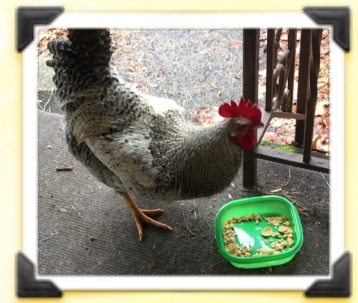
This is Telly, a rooster we rescued. We don't ignore any animal in need