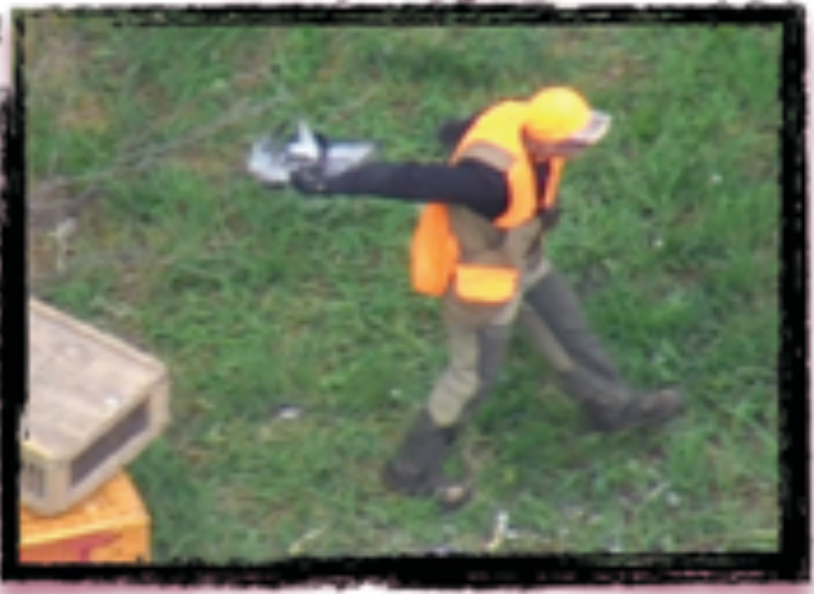
(Left) Ducks Unlimited held a live pigeon shoot at the Minnesota Horse and Hunt Club on March 15, 2018. One of the shooters drove off the road and right at SHARK's investigators. (Right) SHARK was back at the club on May 9th to document a canned quail hunt and live pigeon shoot. Here you see a worker throwing a live bird into the air to be shot