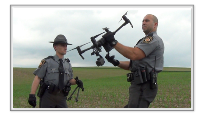
PA State Troopers holding SHARK's shot drone

Though at the time they acknowledged that a crime had been committed, the State Police did nothing more. Five months later, we chose to return to PA to take back our drone as it was clear the higher-ups at the State Police