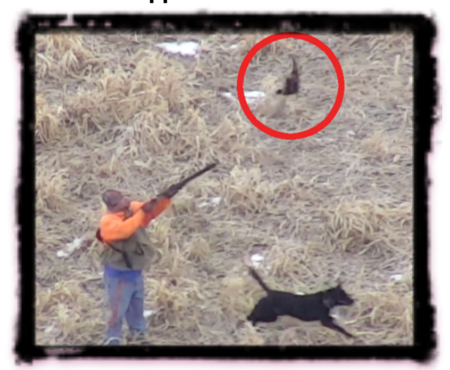
A "hunter" shoots a pheasant at point-bank range in MN

This year SHARK went after a number of canned hunting clubs where birds were used as living targets and shot for fun. One of our biggest campaigns was against the Minnesota Horse and Hunt Club. SHARK documented multiple shoots where hand-raised birds, including quail, pigeons, and pheasants were slaughtered. Our graphic video exposing this club was so powerful that many sponsors, including Carrier, Nutri Source and Minnesota Air, withdrew their support of the club after we confronted them.