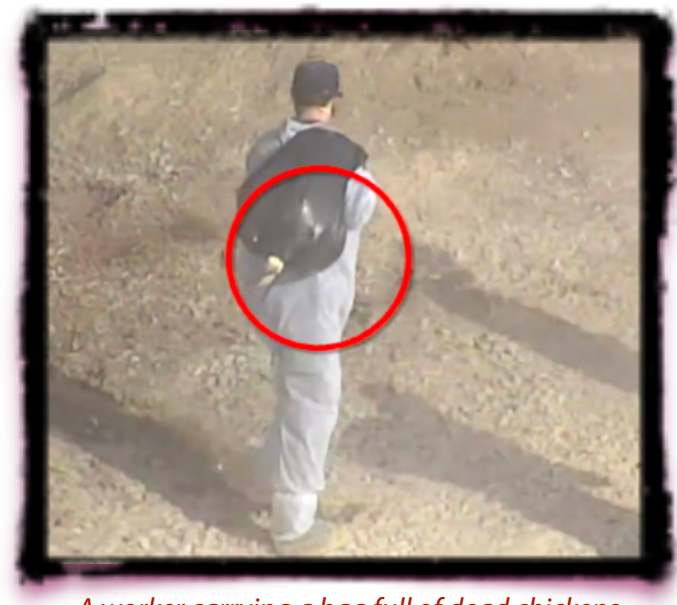
A worker carrying a bag full of dead chickens

California based Humane Farming Association asked us to film a large egg facility for use in its efforts to stop a bad ballot measure in California.