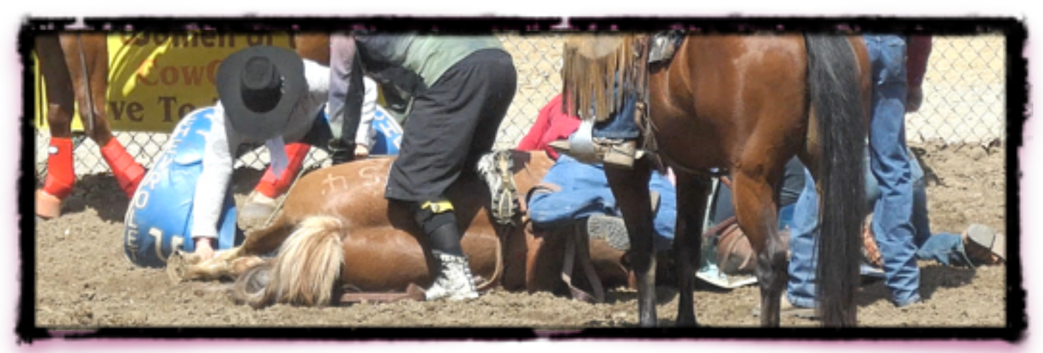
A horse named Savina was killed at the California based Rowell Ranch Rodeo

Rodeo is in a very vulnerable state. If we can focus enough attention on this cruelty, 2019 may a year of significant progress. We will dedicate a good deal of effort to expose rodeo abuse this coming year, and we'll try to bring unprecedented pressure on unethical corporate sponsors.