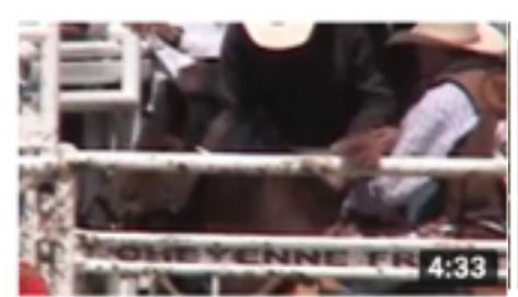
Cheyenne Rodeo "Champion's" Horse Shocked!

These pictures represent just a handful of the more than thousand videos we've released